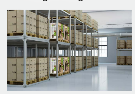
It can be stored in any position, at any temperature (-40^{\circ}\text{C} / +65^{\circ}\text{C}) for years and it does not need any maintenance.