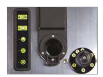
CONTROL PANEL WITH MICRO TOUCH BUTTONS AND ROTARY KNOB FOR STEAM QUANTITY CONTROL