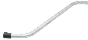
Complete aluminium double wand