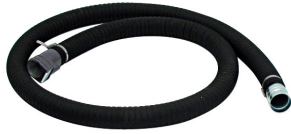
Flexible hose with cuffs 3 mt