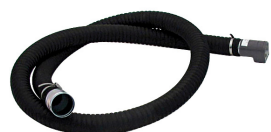
Flexible hose with cuffs 3 mt