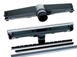
Brush with slides