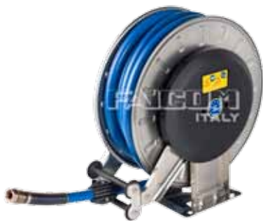
Spring side with guide hose arms in C position Lato molla con bracci guida tubo in posizione C

4R - Standard 4-rollers support on versions indicated in the table 4R - Guida tubo a 4 rulli di serie per le versioni indicate in tabella